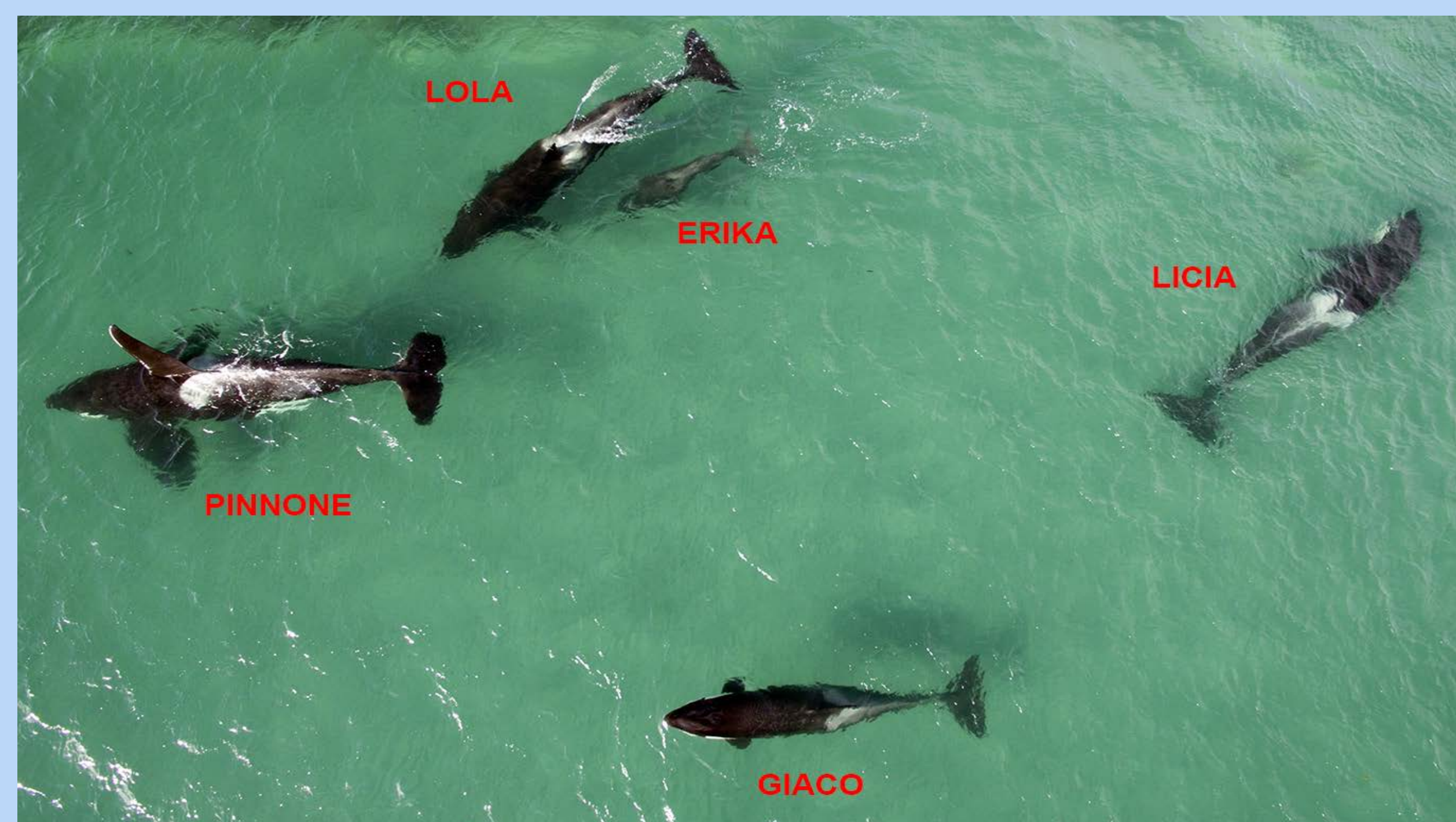
Fig. 4 – Pod from the drone during predation event.