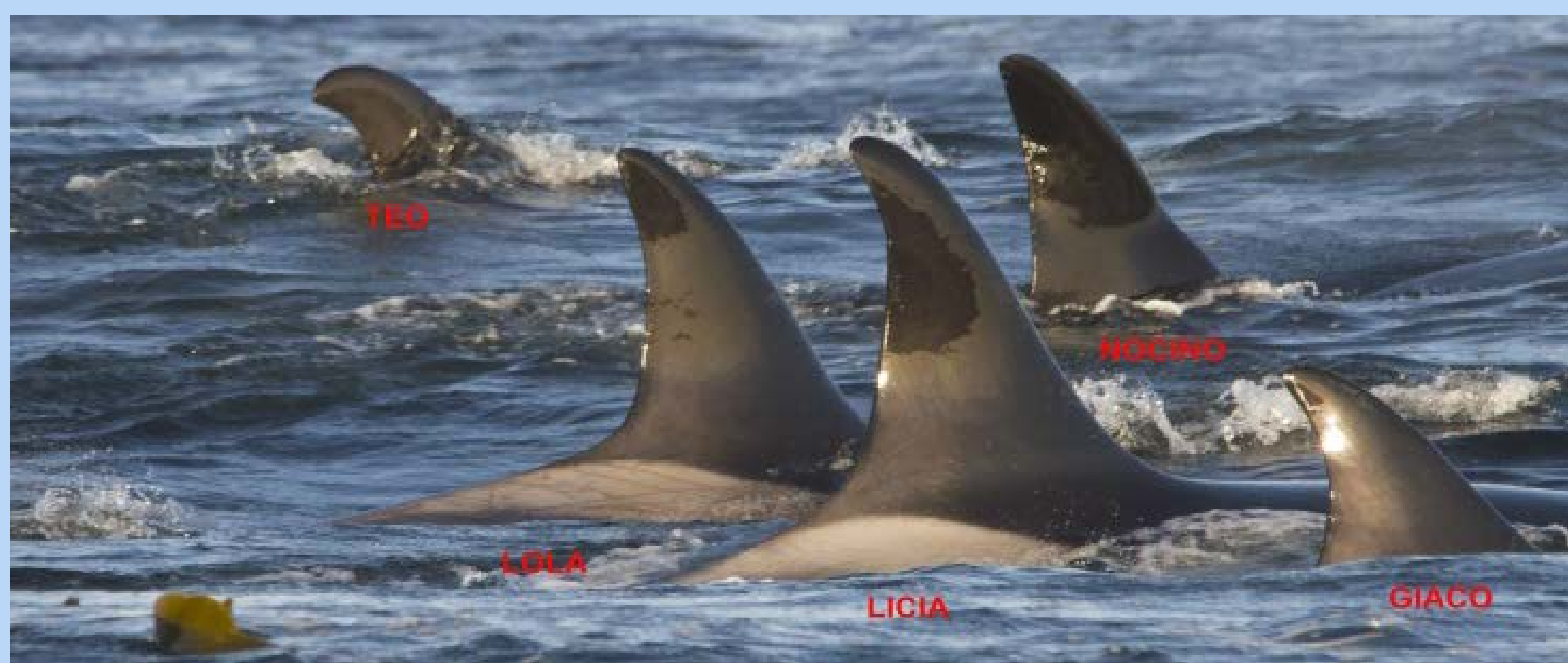
Fig. 1 – A pod of five individuals, two mother-calf groups, Licia plus Giaco, and Nocino plus Teo, and an adult female without calf, Lola.

Killer whales ( Orcinus orca ; KW hereafter; Fig. 1) are apex predators with a worldwide distribution. Their diet includes a large array of species, from fish to marine mammals, and can be more or less specialized. This diet variability is linked to a large variation in hunting techniques. KW have a hierarchical social system, based on long-term bonds between related individuals, and a complex communication system. The main goal of this research was to study KW sociality during predation events at Sea Lion Island (Falkland Islands; SLI hereafter), that hosts breeding colonies of various potential KW preys, including southern elephant seals (SES hereafter), southern sea lions (SSL), and various species of marine birds and penguins.